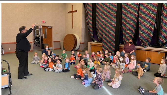
Recently a Magician visited. The children were amazed.