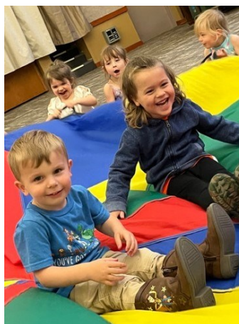
Preschool having fun with a parachute.