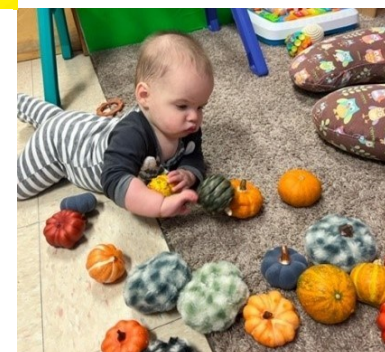
Infants exploring pumpkins.