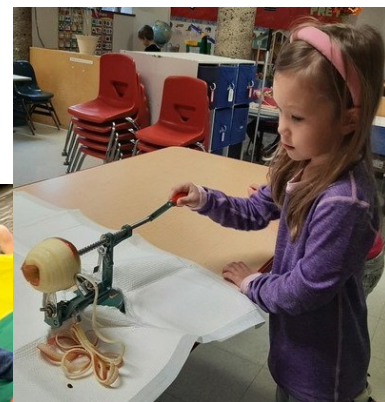
The Pre-K peeling apples to help make applesauce.