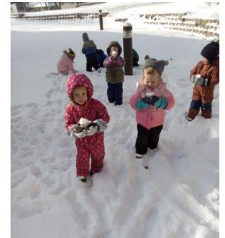
Preschool playing outside