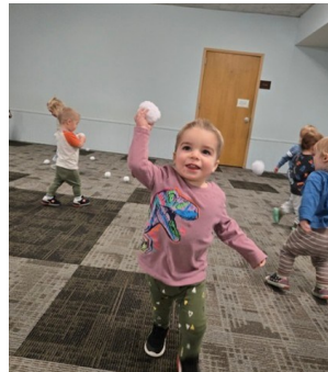
Toddler’s indoor “snowball” fun