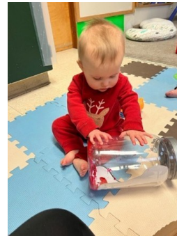
Making Christmas ornaments