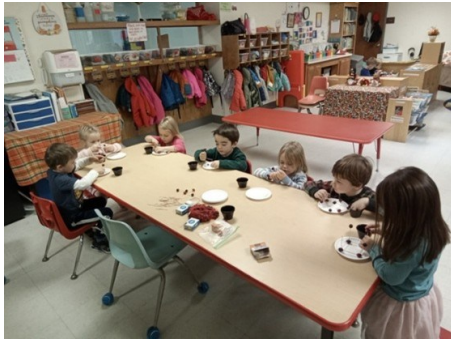
Pre-K making cranberry sculptures